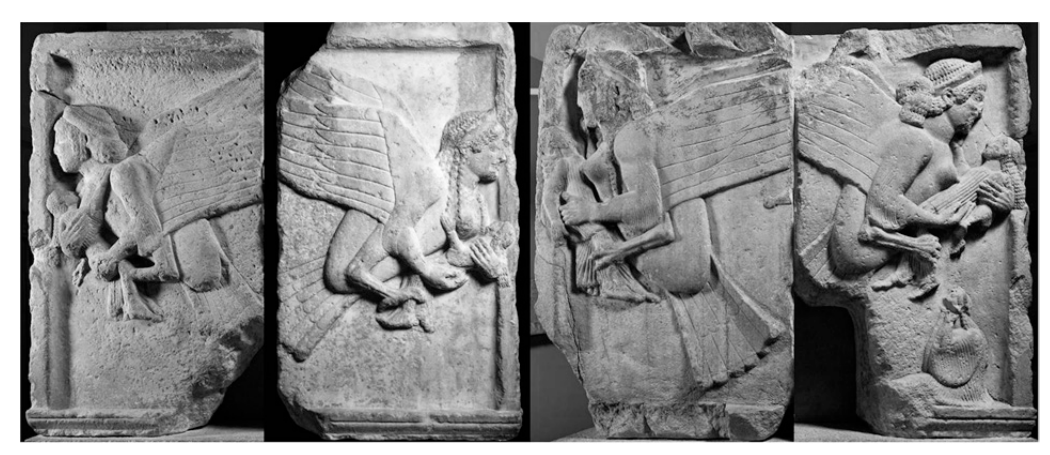
Fig. 5. Xanthos "Harpy" Tomb. Sirens

standing on an Ionic column. The carving of the head of this creature has been damaged but apparently depicted a bird from the feet, tail, wings and lower part of its body and with the form of a human for the upper part of its body. Parallel to the human-like arms depicted frontally; the wings at the back are open to the sides. It wears a khiton with a belt, the arms of the khiton reach to the elbows and it encloses the upper part of the body. The monument was discovered by C. Fellows, as was the " Harpy " monument, and it was brought to the British Museum in 1838. Researchers have dated this monument to later than the " Harpy " tomb<sup>6</sup>.