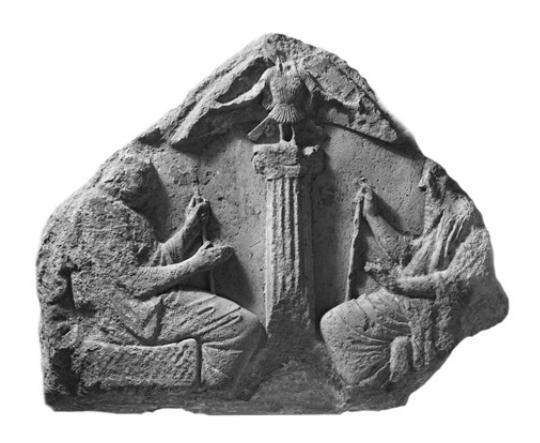
Fig. 6. Xanthos "F" Monument

representative of the soul which leaves the body at will and then returns to it. This figure, known from its mention in the Book of the Dead is also known from its depictions in Egyptian wall paintings and reliefs<sup>9</sup> (fig. 7).