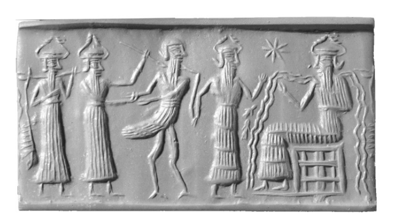
Fig. 8. "Zu" Depiction on Cylinder Seal. Akkadian