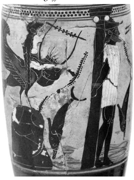
Fig. 14. White Ground Lekythos

As a result, in Greek belief the Sirens' connection with death can be said to begin with Homeros. But after