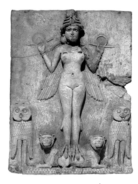
Fig. 12. Mesopotamian Ishtar

of sirens begin to be found in the Orientalizing Period<sup>30</sup> and in these depictions these hybrid creatures are employed to form a part in ornamental animal friezes and do not have a thematic sense<sup>31</sup>. The name siren first occurs on an animal frieze on a vase dating from the VI century B.C.<sup>32</sup> (fig. 13). Prior to this period they had sometimes been depicted without carrying any thematic sense, as a female, or sometimes as a bearded man<sup>33</sup>. For example, they are depicted together with an erotic subject on a kylix and are employed as a filling pattern on a variety of pottery examples<sup>34</sup>. That these creatures, recognized as female in Greek Mythology, are depicted in different gender and without any regard to thematic content can be explained as being a consequence of their being foreign imports into the Greek belief system<sup>35</sup>.