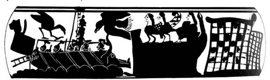
Fig. 13. Aryballos

of sirens begin to be found in the Orientalizing Period<sup>30</sup> and in these depictions these hybrid creatures are employed to form a part in ornamental animal friezes and do not have a thematic sense<sup>31</sup>. The name siren first occurs on an animal frieze on a vase dating from the VI century B.C.<sup>32</sup> (fig. 13). Prior to this period they had sometimes been depicted without carrying any thematic sense, as a female, or sometimes as a bearded man<sup>33</sup>. For example, they are depicted together with an erotic subject on a kylix and are employed as a filling pattern on a variety of pottery examples<sup>34</sup>. That these creatures, recognized as female in Greek Mythology, are depicted in different gender and without any regard to thematic content can be explained as being a consequence of their being foreign imports into the Greek belief system<sup>35</sup>.