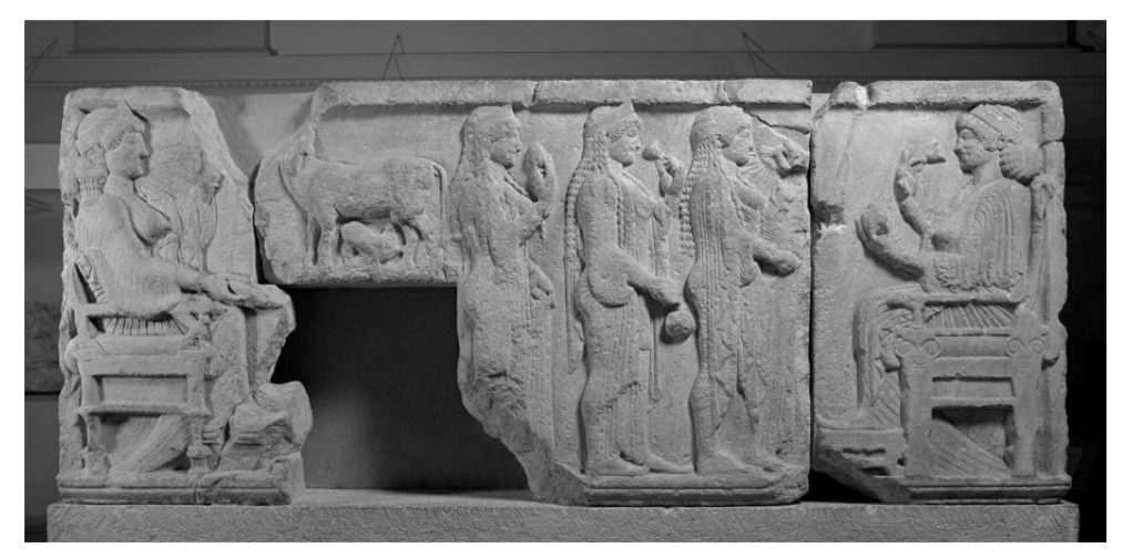
Fig. 1. Xanthos "Harpy" Tomb. West Side