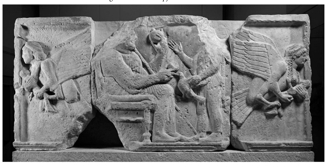
Fig. 2. Xanthos "Harpy" Tomb. South Side