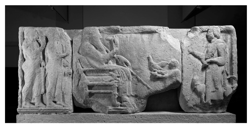
Fig. 4. Xanthos "Harpy" Tomb. East Side

were elaborated upon in various publications but no one could arrive at a consensus. Some of the determinant elements of the iconography of this monument, usually dated to the first quarter of V century B.C., to between 500 and 480 B.C.<sup>3</sup>, were evaluated in addition to the main composition in this study, through fresh observations and the attempt is made to provide a meaning for these figures.