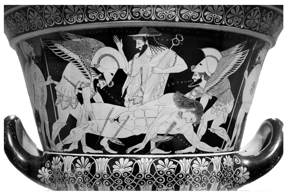
Fig. 15. Calix Krater. Work of Euphronios.

In this context, it is a remarkable fact that the Hittites offer birds connected only with death and underworld and see them as means of access to the underworld. In Greek thought, the bird is not considered to be the soul bearer but to be the symbol of soul. Although Sirens are divine creatures, in the beginning they contain different subjects and narrations. The conveyance of the deceased or the spirit is perceived differently in Greek thought. Although vase paintings depict scenes of the deceased moved by a winged-human figure, this being is interpreted as the conveyor of the soul<sup>61</sup>,