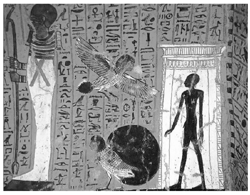
Fig. 7. Egyptian Wall Painting. Thebes