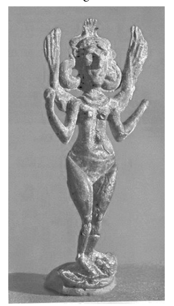
Fig. 10. Hittite Ishtar from Karahöyük

in spiritual depictions<sup>17</sup>. Another noteworthy characteristic of Hittite belief is a "bird's" position in relation to death and the underworld<sup>18</sup>. In Hittite records it is asserted that the God of Storm thinks only birds worthy to offer to the underworld gods<sup>19</sup>; and it is known from Hittite funeral texts that birds are sacrificed at the funerals of kings and queens<sup>20</sup>. F. Sevinç draws attention to the point that birds may have been perceived as creatures that can fly in the underworld with their excellent wings and relates the existence of wings in depiction of some of the underground gods to this understanding<sup>21</sup>.