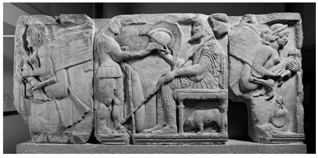
Fig. 3. Xanthos "Harpy" Tomb. North Side