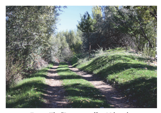
Fig. 1. The "Pontic road" at Nikopolis

The "Pontic Road" represents a continuation of the road leading from Erzincan in the Euphrates valley westward into the drainage basin of the Lykos (Kelkit) river. The first city on the road, Nikopolis, is located ca. 90 km to the west of the divide between the two river systems, ca. 1,4 km south of and ca. 130 m above the line of the present highway (Fig. 1). To the northwest, the city