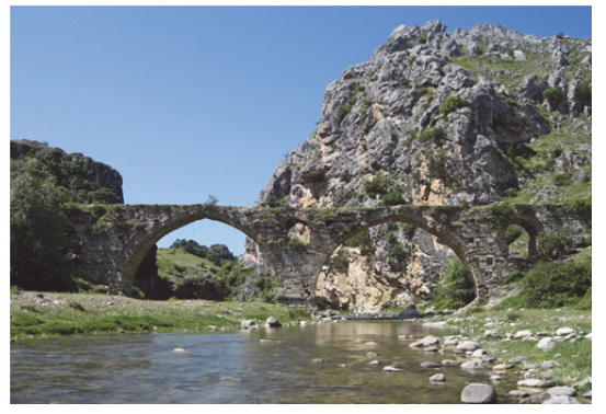
Fig. 6. The Kurt Köprüsü in 2010. The Bridge has since been Heavily Restored