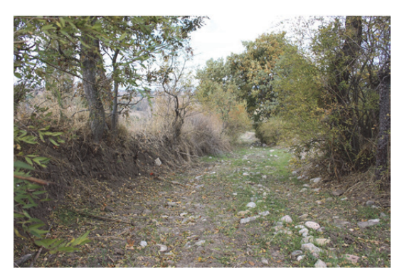
Fig. 8. The "Pontic Road" West of Aydoğdu