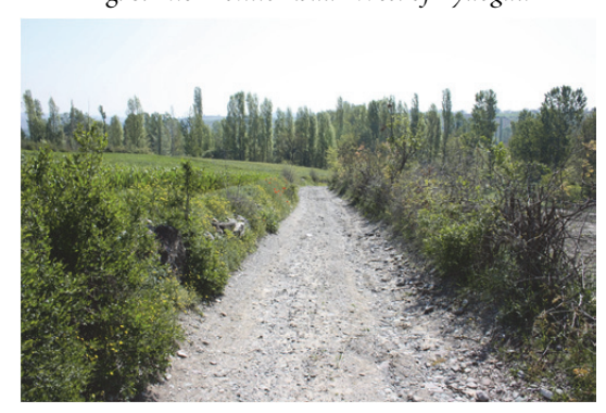
Fig. 10. The "Pontic Road" near İncesu

ment<sup>42</sup> or from a Roman stone bridge at this same location. From the crossing, the road climbed to the plateau on the western side, then continued through the villages of Aydoğdu (Fig. 7-8) and Çekmeden to reach Neapolis (Vezirköprü), where it met a north-south road connecting Oymaağaç and Tepeören<sup>43</sup>. Assuming that Neapolis had an orthogonal street plan, the "Pontic Road" must have traversed the city running east-northeast to west-southwest.