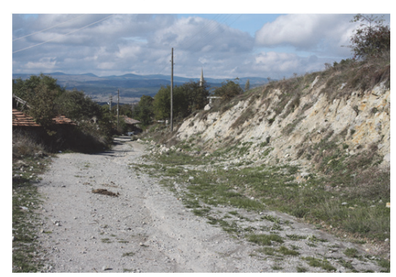
Fig. 5. The "Pontic Road" Descending through Baspelit Village

Having crossed the Amaseia-Amisos road at an elevation of ca. 770 m above sea level, the " Pontic Road " now descended through Başpelit (Fig. 5), Ilica and Kocaoğlu to Kayabaşı (540 m a.s.l.). From here, it made a steep switchback descent into a ravine to cross a small stream, the Istavroz çayı, at 420 m a.s.l. The stream is spanned by a stone bridge (Fig. 6) known as the Kurt köprüsü, " wolf bridge ". Its semi-ogival main arches attest to a post-Roman date, but the bridge incorporates inscriptions and other spolia of the Roman period which may derive either from a neighbouring settle-