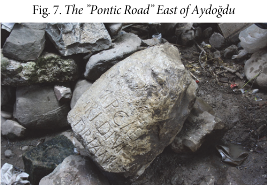
Fig. 9. Fragment of a Milestone from the "Pontic Road" (138-161 A.D.), Now in a Farmyard in Arıca Village