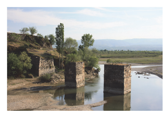
Fig. 2. Remains of the Bridge Carrying the "Pontic Road" across the Iris

overlooks the plain of Suşehri, which is bisected by the Lykos river. Across the plain, the ancient road may have taken a course differing from that of the modern highway. From the point where the road enters the river gorge at Akçaağıl, however, the only route to the west is along the bank of the Lykos, which the road follows for the next 90 km, corresponding to three days' march for a Roman army. The steep and rocky hillsides offer few opportunities for settlement<sup>39</sup>, or for an army to forage; one can well understand Mithradates' hope that his Roman pursu-